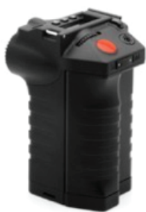
1 – DSMC Side Handle (Attached)