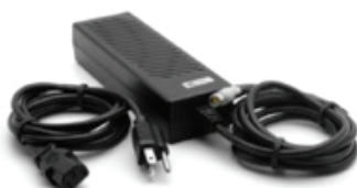
1 – 110v Power Supply w/camera connector cable and power cable