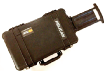
Pelican 1510 Case