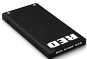
1 – SSD-64GB