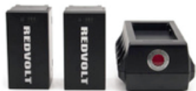
2 – Batteries 1 – Charger w/power cable