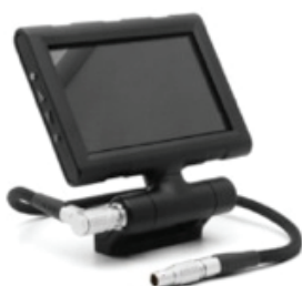
1 – 5" Touch Monitor w/connector cable 2 – ¼ x 20 Hex Head Screws w/hex wrench