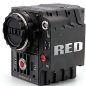
1 – Red Scarlet Serial #01779