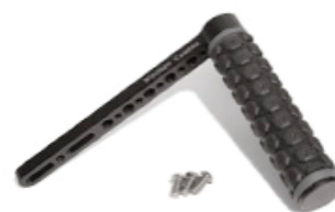
1 – Wooden Camera Side Handle with rubber grip 3 – 1/4"x20 mounting screws w/hex wrench (fits hot shoe also)