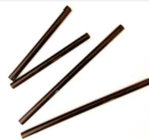
2 – 15mm-12" Carbon Fiber Rods 2 – 15mm 9" Carbon Fiber Rods