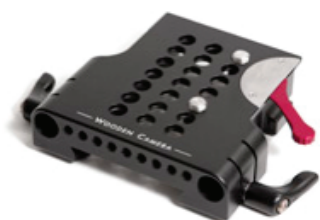
1 – Wooden Camera Bridge Plate w/Libec screwdriver