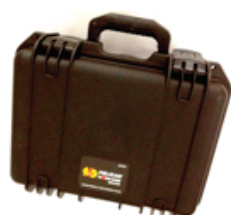
1 – Pelican iM2100 Case