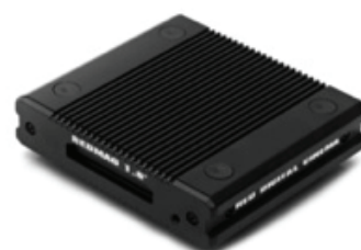
1 – RedMag SSD Reader w/power supply