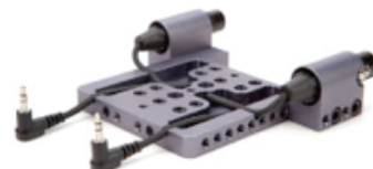
1 – Fortis Riser Plate with mini to XLR adapters (Attached)